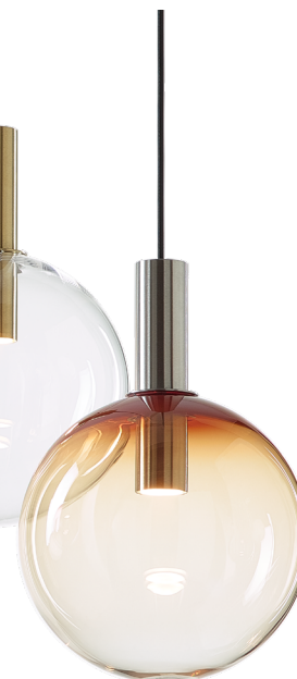
red orange brushed silver