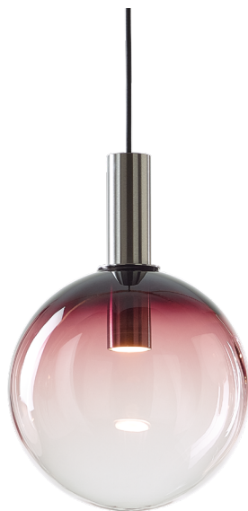
plum brushed silver