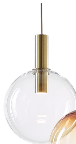
clear brushed gold