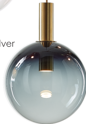
smoke brushed gold