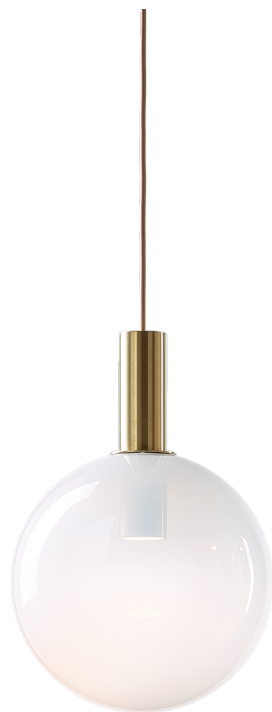
white brushed gold